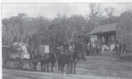
Cabbage Tree Hotel, undated

Kicking off with a BBQ lunch (bring a salad, meat provided) the aim is to erect the cyclone wire, header for the gate & the bottom rails on the west side of the courts to enclose the space. ALL WELCOME , Many hands make light work!