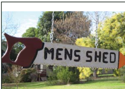
Thanks to Brian for the new Men's Shed sign which hangs under the Woods Road street sign on the corner of the Princes Highway.

A Public Open Space fund of just over $3,000 will replace the toilet suites and handbasins in the public loos. The water will need to be connected after the downpipes are in place.