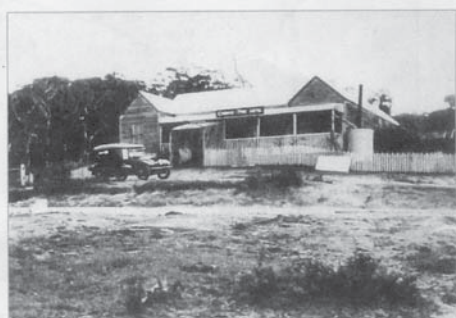
Cabbage Tree Hotel 1927